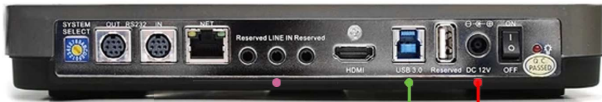
Shown: ClearOne Unite 200